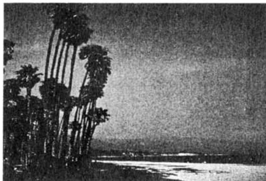
Santa Barbara, California

The hard-cover Proceedings containing all papers presented was published by the Begell House Inc. Three international journals, i.e., Int. J. Heat Fluid Flow , Exp. Therm. Fluid Sci. , J. Flow Turbulence Combustion , are planning to publish special issues containing selected papers within a year time. Finally, the 2 nd TSFP will be held at the Royal Institute of Technology (KTH) in Stockholm, June 2001, and its details are found on the webpage at http://www/mech.kth.se/tsfp2 .